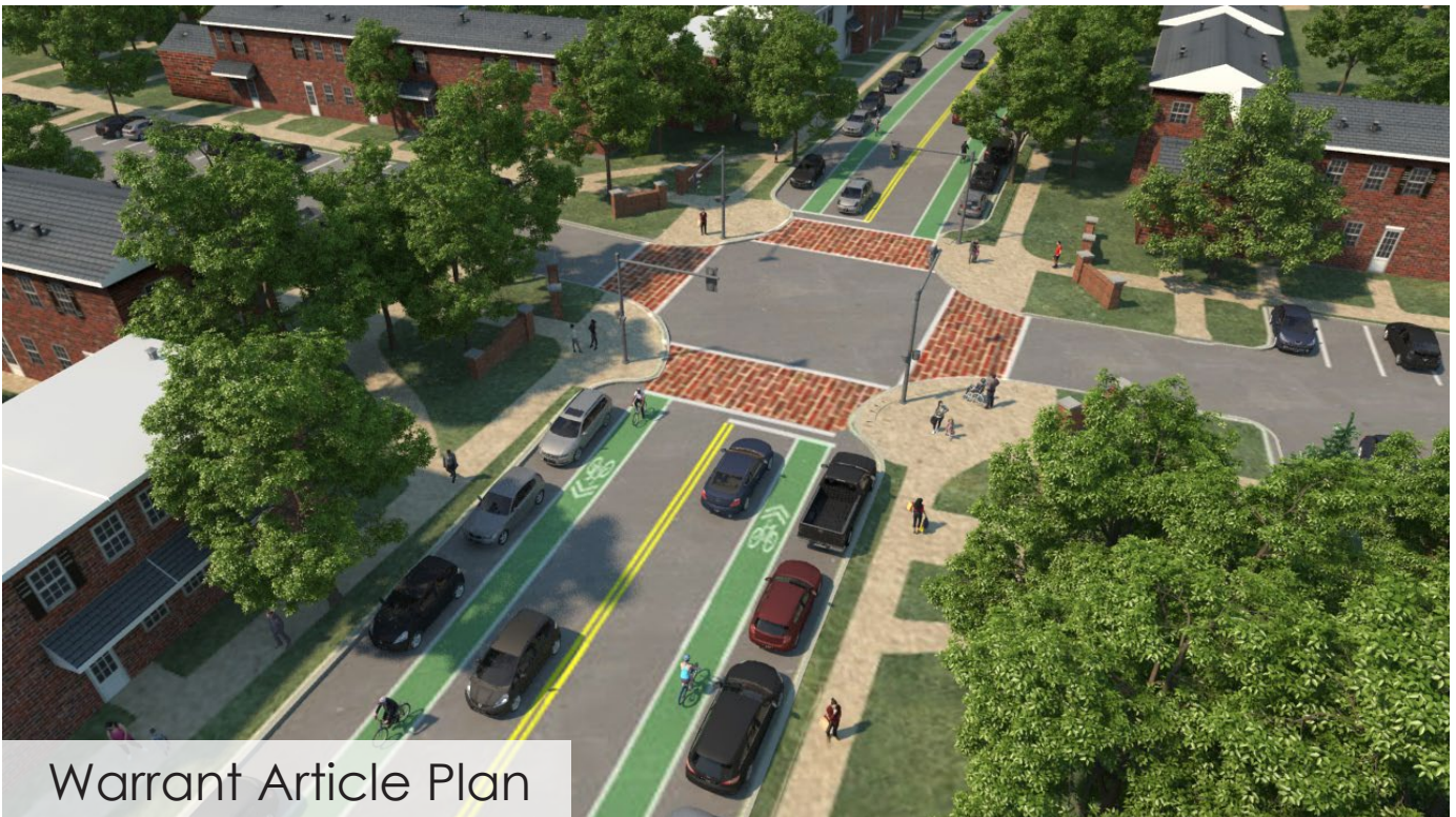
Warrant Article Plan