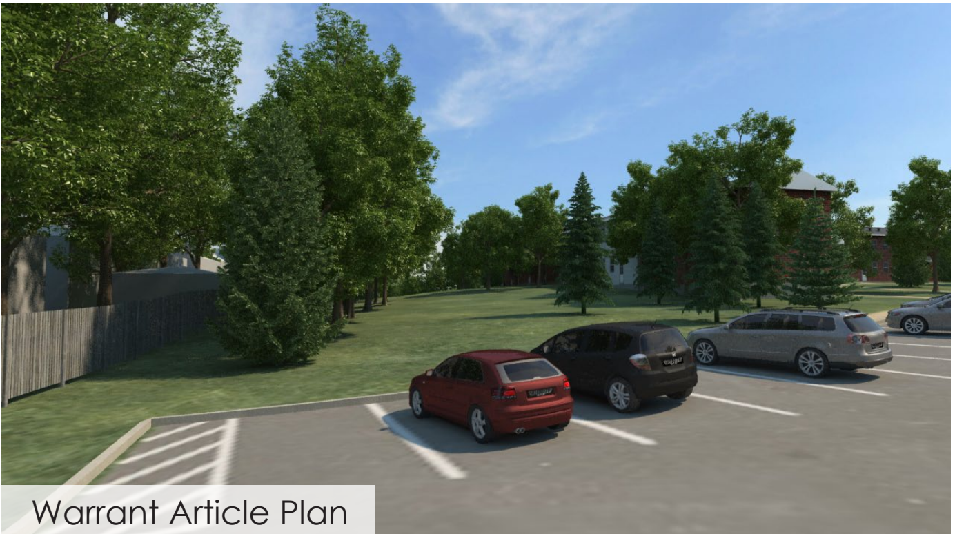
Warrant Article Plan